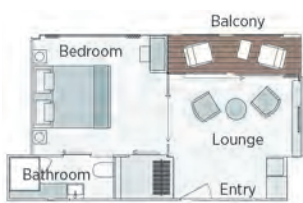
Owner's One-Bedroom Suite