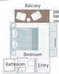
Panorama Balcony Suite