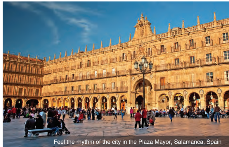
Feel the rhythm of the city in the Plaza Mayor, Salamanca, Spain

DAY 1 Depart the USA: Depart the USA on your overnight flight to Lisbon, Portugal.