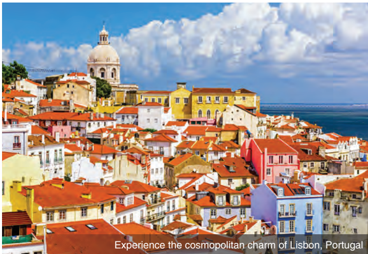
Experience the cosmopolitan charm of Lisbon, Portugal