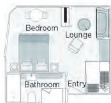
Emerald Riverview Suite