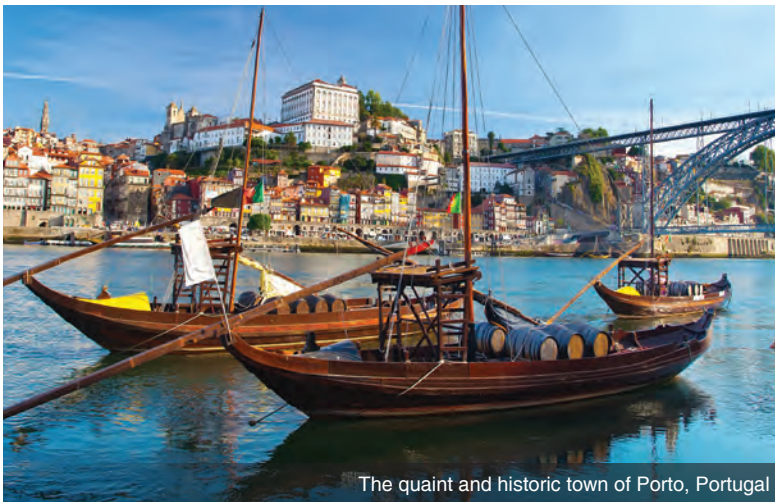
The quaint and historic town of Porto, Portugal

DAY 9 Régua – Lamego: From Régua, journey to the marvelous baroque village of Lamego, home to the Sanctuary of Our Lady of Remedies - one of the most important pilgrimage sites in Portugal. Visit the Sanctuary perched atop the hill, with its iconic 686-step granite staircase, decorated with the traditional Portuguese blue and white 'azulejos' tiles. During a guided walk through the village, learn about the importance of wine production to the local area. Return to the ship in Régua after the excursion. Meals: B, L, D