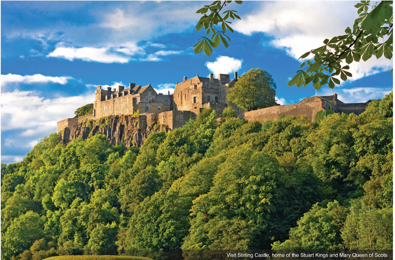
Visit Stirling Castle, home of the Stuart Kings and Mary Queen of Scots