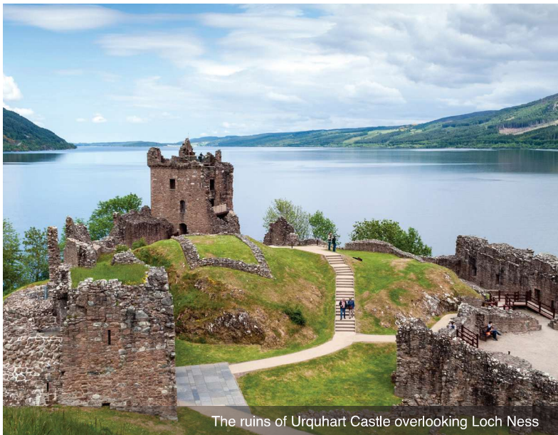
The ruins of Urquhart Castle overlooking Loch Ness

panoramic city tour, see the historic Old Town and the elegant Georgian New Town, both UNESCO World Heritage Sites. Visit the city's icon, Edinburgh Castle, perched high atop a hill, offering panoramic views of stately mountains, rolling hills and lovely countryside. Inside the castle, stand in awe of the Scottish Crown Jewels, featuring the crown, sword, and scepter, which are among the oldest regalia in Europe. After free time for lunch on your own, depart for Roslin, a tiny village outside Edinburgh, where you visit Rosslyn Chapel. This 15th-century church is famous for its decorative art and mysterious associations with the Knights Templar and the Holy Grail. This evening, dinner is included. Meals: B, D