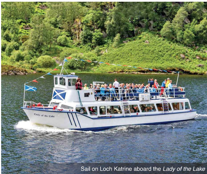
Sail on Loch Katrine aboard the Lady of the Lake