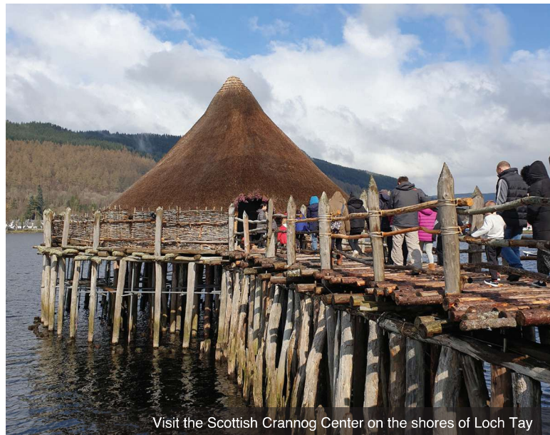
Visit the Scottish Crannog Center on the shores of Loch Tay

DAY 1 Depart the USA: Depart your gateway city on an overnight flight to Glasgow, Scotland.